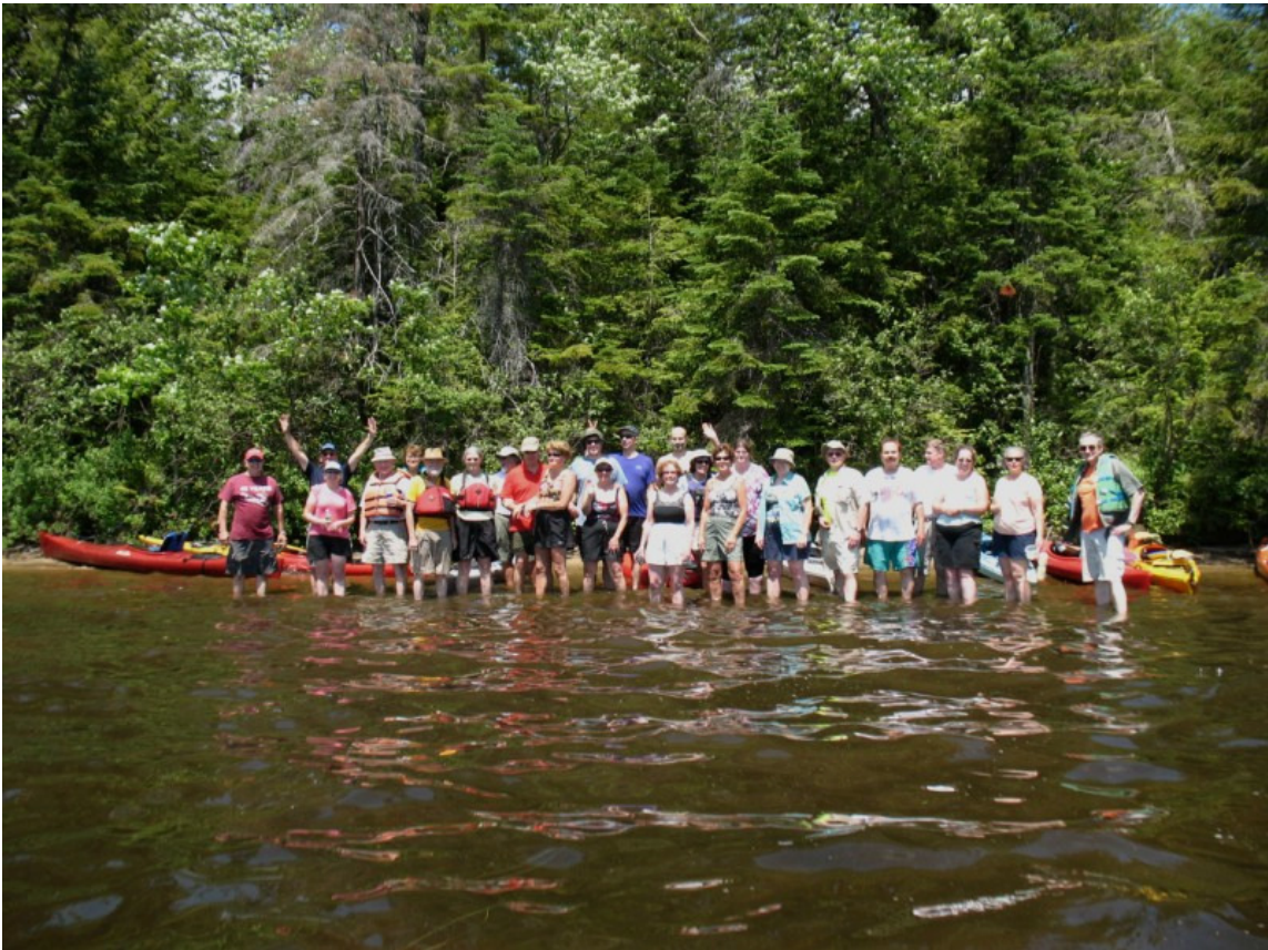
Oxbow Lake – May 2010